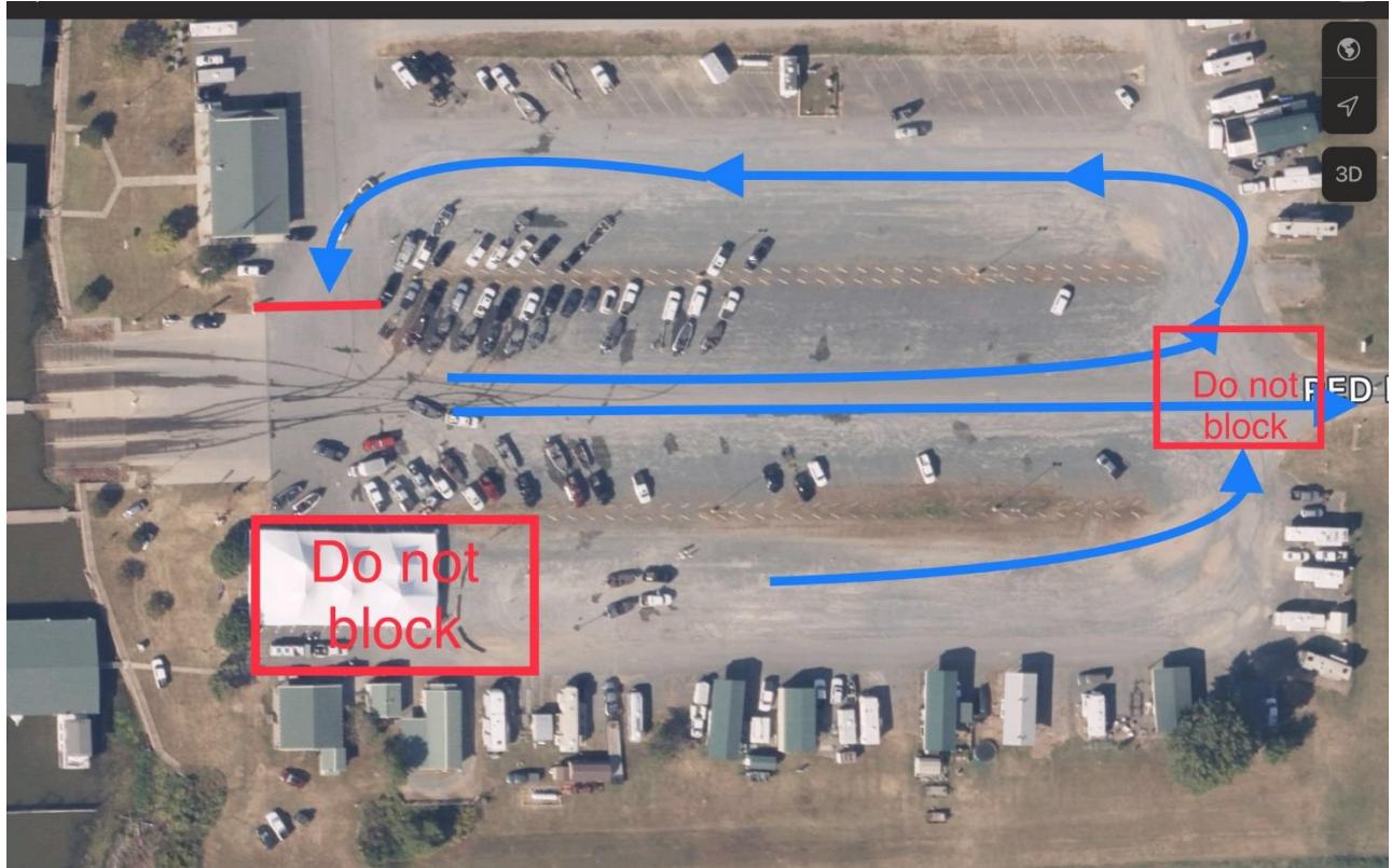
Afternoon Traffic Flow