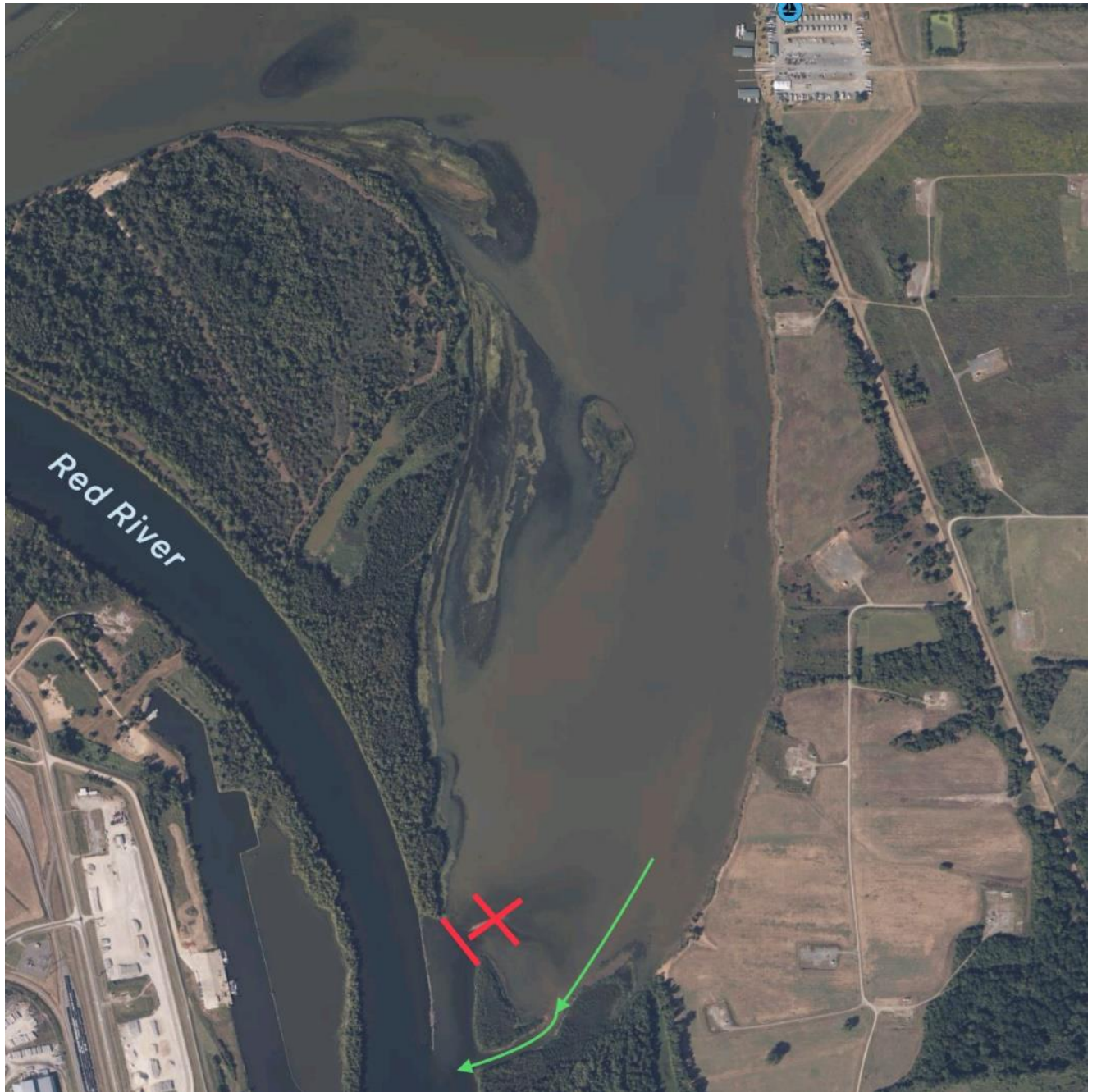
Danger area and boat lane