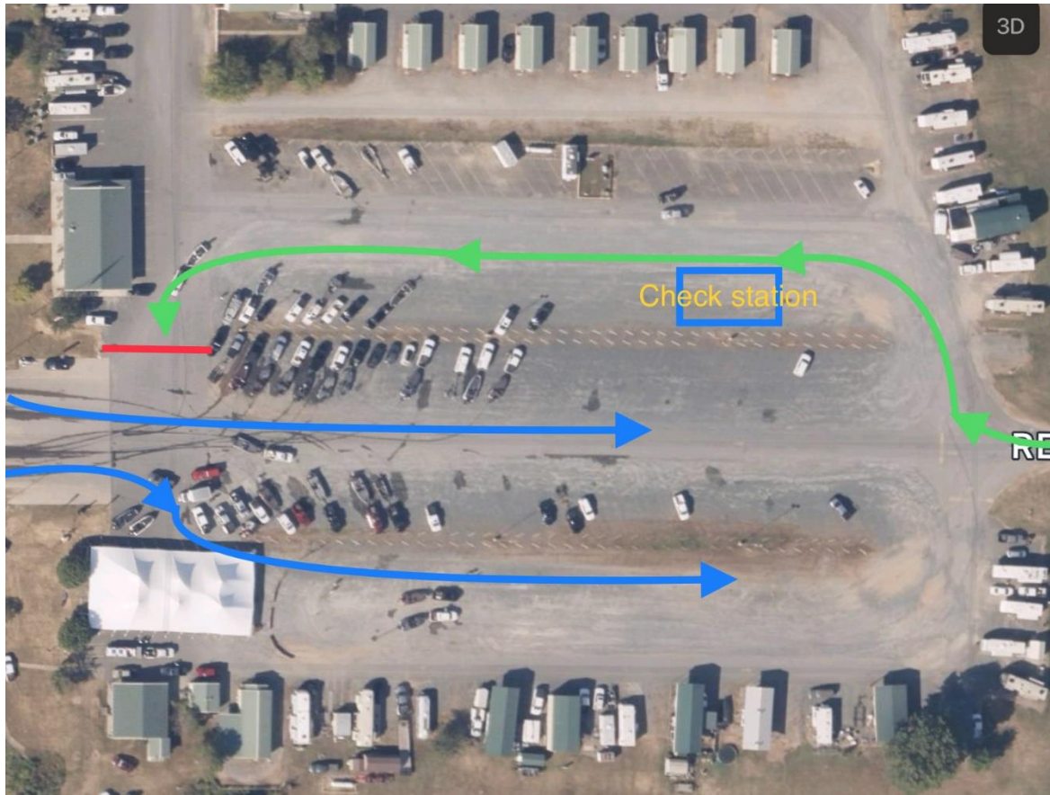
Morning Traffic Flow